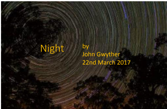
EOS60D, 18mm, f/4.5, 1600 ISO, 523x15sec L (interval=45 sec) plus 6x15sec D stacked in StarStax